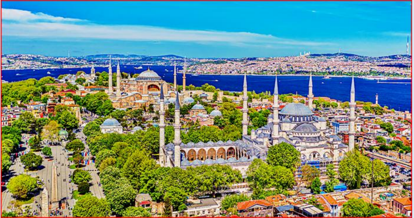
Stambuł – Błękitny Meczet; na drugim planie: Hagia Sophia