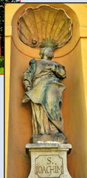
Kaplica św. Anny