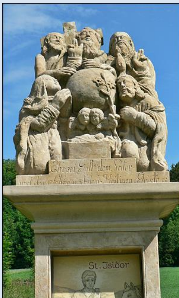
Pomnik ku czci Świętej Trójcy