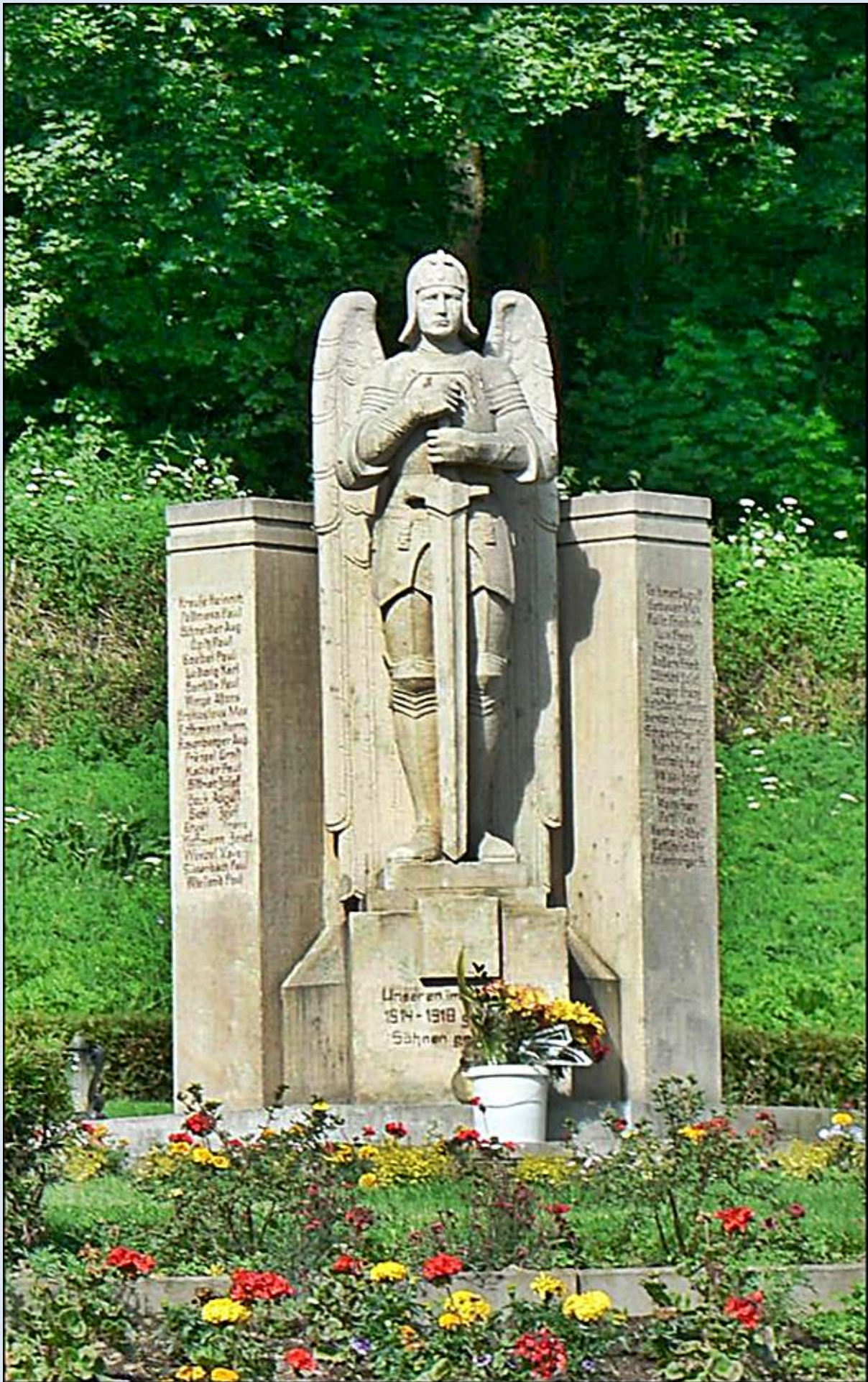
Pomnik poległych żołnierzy „Archanioł Michał”