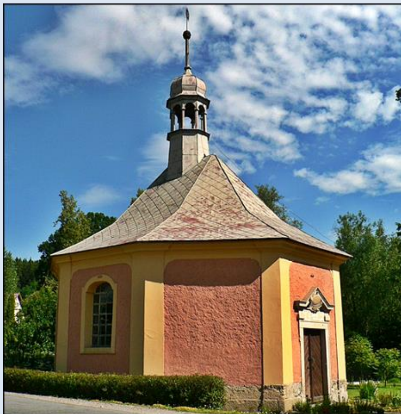
Kaplica Pokutna pw. św. Marii Magdaleny